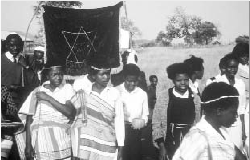
The Lemba of northeast South Africa trace their origins to the Middle East and consider themselves Jews.

DNAPrint Genomics claims to offer an exact quantification of an individual’s genetic origins. Ironically, it’s precisely because of this kind of obsession with racial quantification that many of the “little races” of the South survived for so long. In a society where people were strictly classified, socially and often legally, as either white or black, there was little conceptual space for people who did not quite count as either. When