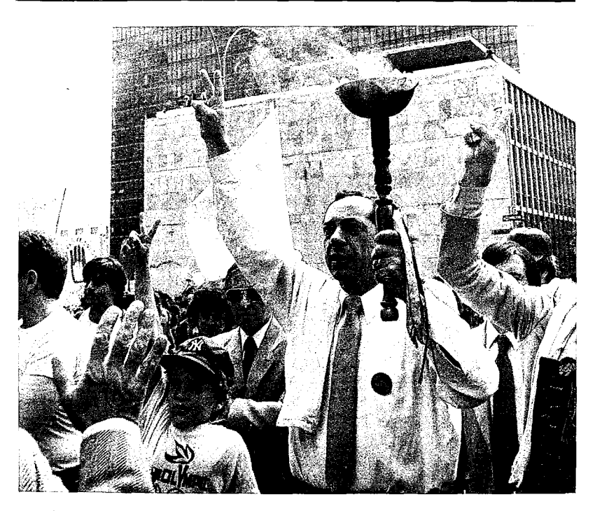
Mario Cuomo, then lieutenant governor of New York, holds torch of peace at the United Nations building in Manhattan (1982); massive anti-Reagan "nuclear freeze" rally attracted leading Democratic politicians.

disobedience could avert nuclear catastrophe. The Episcopal Cathedral of St. John the Divine in New York City was declared a "nuclear weapons free zone." Evangelical Protestants formed "Evangelicals for Social Action," and produced a monthly, Sojourners , that carried freeze themes to the country's fastest-growing denominations.