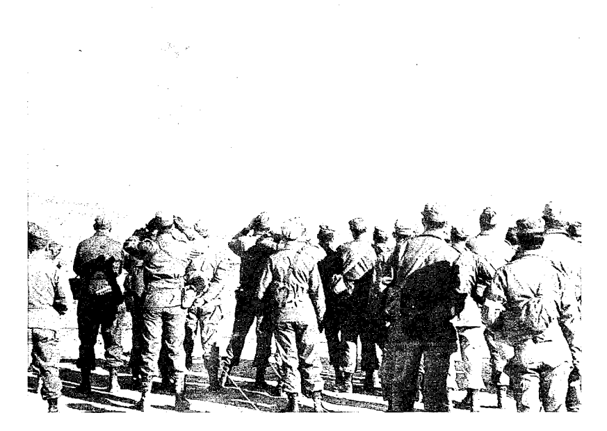
Military observers at an atomic weapons test at Frenchman's Flats, Nevada (1951). U.S. armed services were becoming interested in low-yield "tactical" devices; pacifists' protests came later.

1945 Saturday Review essay, "Modern Man Is Obsolete," argued that the concept of national sovereignty was "preposterous now."