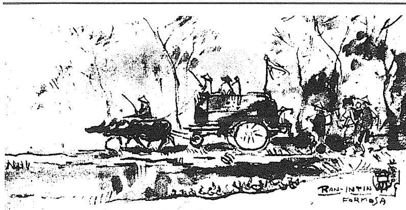
Farmers Going Home by RAN INTIN. Used by permission.

Taipei in the north, near the best harbors. There he built Taiwan's first electric power station in 1887, installed street lights, and provided the city with a limited postal system. Liu also founded a Western-style school in Taipei, with English and Danish instructors. (Taiwan's schools had hitherto stressed Chinese classics, with little or no attention given to technical subjects or foreign languages). In 1891, Taiwan's first railway (the second in all of China) was completed. The Chinese on the mainland came to think of the island as a model province.