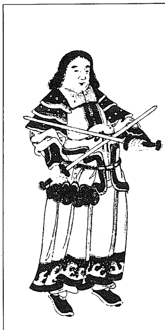
From A Chinese scroll.

Archer, scholar, pirate, the versatile Koxinga established Taiwan's first government. "This island was the dominion of my father," he told Dutch colonists. "Foreigners must leave." Although Koxinga's father betrayed the Ming cause, the old man's death affected Koxinga deeply, and at night he would "mourn and weep facing the north."