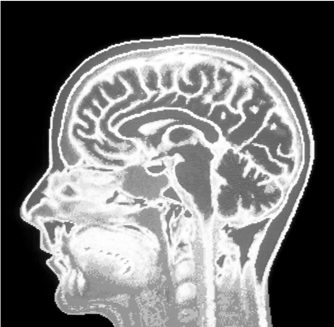
Brain imaging can reveal key structures of this 42-year-old woman's brain, but the ability to read (and heal) minds remains a distant prospect.

journals if their article tells the story of an individual patient, or includes any personal thoughts or feelings about the people or the work that patient was engaged with, or fails to include a large dose of statistical data. Psychiatry used to be all theories, urges, and ids. Now it's all genes, receptors, and neurotransmitters.