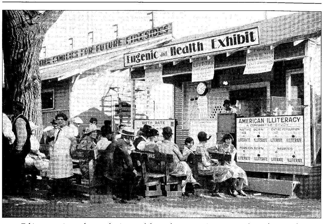
Taking eugenics to the people: At an exhibit at the Kansas State Fair in the mid-1920s, the high rate of illiteracy among immigrants and blacks was attributed to inferior genes.

cial pathologies that they attributed primarily to biological causes—to "blood," to use the term for inheritable essence common at the turn of the century.