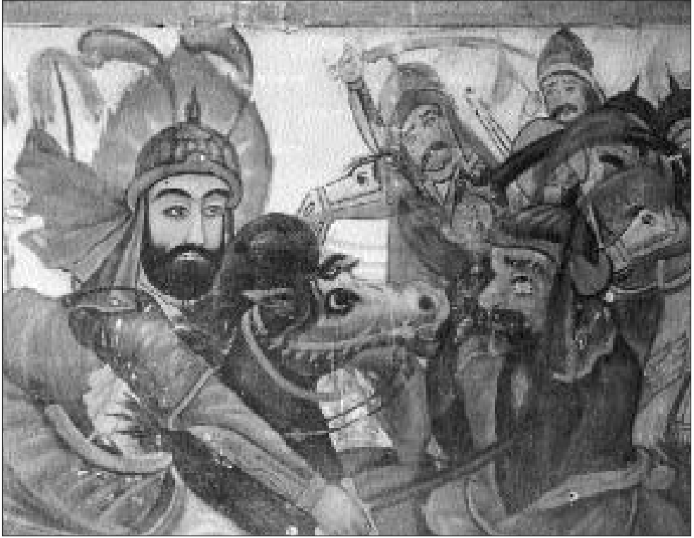
Crisis and schism are recurring features in the history of Islam. This scene from a Persian fresco depicts a seventh-century battle between the Shiite Imam Shah Zaid and his enemies.

1800, governments took control of the financial endowments that mosques, seminaries, and other religious institutions had amassed over the years from the contributions of the faithful. Many of these endowments were considerable, and in Egypt, Iran, and other countries had had the effect of gradually concentrating a significant share of the national wealth under religious control. Confiscating this resource, as Egypt did early in the 19th century, or centralizing its administration in a government ministry, the later Ottoman practice, put financial control in the hands of the state. Mosque officials, teachers, and others employed in many religious institutions now were subject to government pressure.