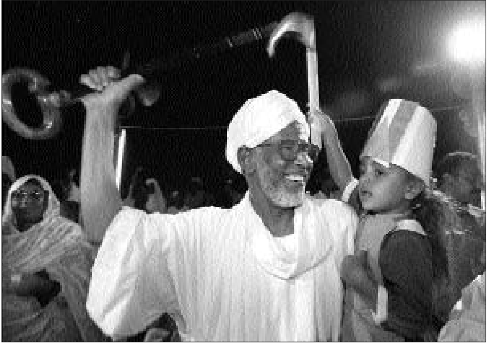
Hasan Turabi, one of Islam's "new authorities," celebrates his Islamic Front's victory in Sudan's 1996 parliamentary election. Sudan played host to Osama bin Laden in the 1990s.

they appreciated the contemporary vocabulary and viewpoints of the new Islamic writers. So long as nationalism offered them the promise of a better future, they remained loyal to their political leaders and governments. But when the nationalists' dreams failed and the future dimmed, as it did in most Muslim countries during the 1970s, people looked elsewhere for hope and inspiration, and they didn't have to look far.