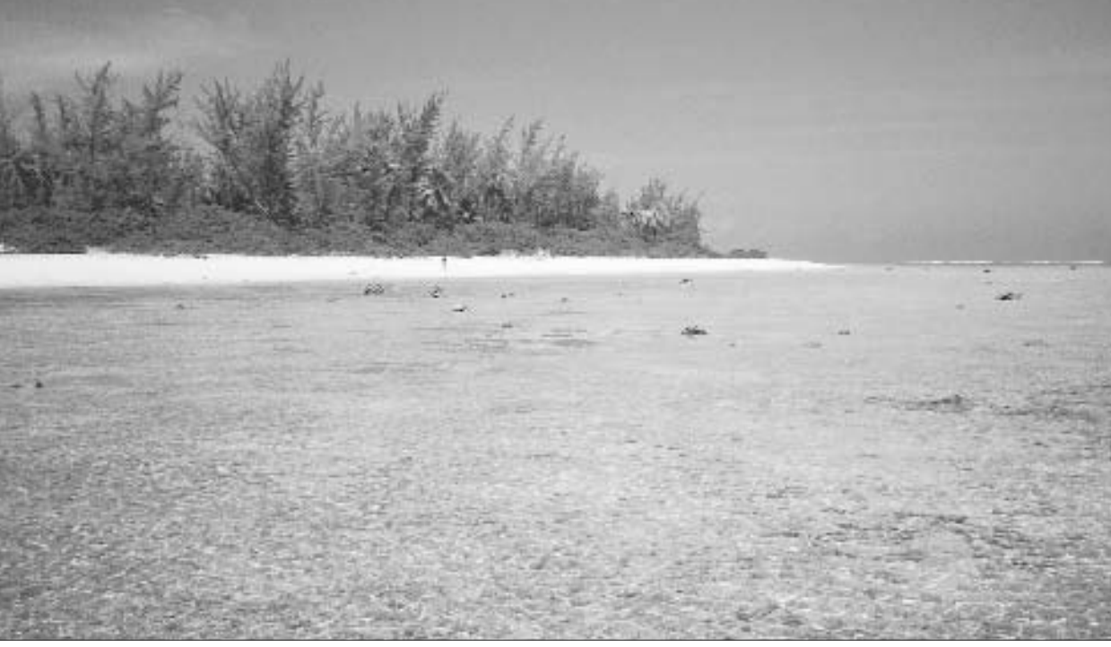
The tip of South Agalega, one of the most remote islands in the world.

"Now that would be an interesting place for you to visit," Michel advised. "That's where you will find the true island life. A place where people live without money. Where you live in tranquility, as part of nature. A total break with your normal routine, away from modern life, away from the pressures of home and work."