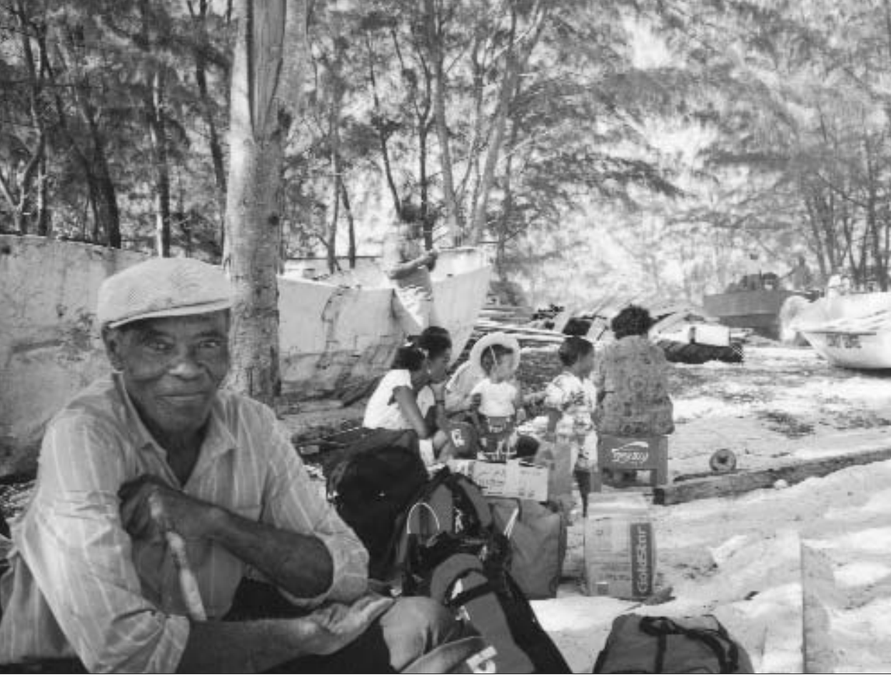
Waiting on Agalega for the Mauritius Pride and the long, rough sea trip back to Mauritius.

Agalega, who quickly dispensed with the formalities. No sooner had he greeted and backslapped his counterparts than he became engrossed in our latest edition of Le Mauricien. Were people stationed on Agalega so starved for news of the outside world that reading a newspaper took priority over clearing exhausted passengers for disembarkation? Not necessarily. Reports of police brutality on Agalega had recently become national news, and the police commander wanted to know at once how his role in the beating of a young Agalacian man had been reported in the Mauritian press. A surfeit of alcohol and a scarcity of women had apparently strained relations between transient Mauritian officers and native Agalacians. In a drunken row over an island girl, an Agalacian had been so severely beaten by Mauritian policemen-in the station house-that he required evacuation, by air, to a hospital in Mauritius. The police commander seemed satisfied with the uninformative newspaper account.