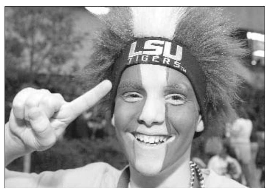
Winning teams generate alumni donations—and boost applications for admission.

So we do college as we do lunch or do shopping or do church. That's because for most students in the upper-tier schools the real activity is getting in and then continuing on into the professional schools. No one cares what's taught in grades 13–16. How many times have I heard my nonacademic friends complain that there's no coherence in the courses their kids are exposed to? Back in the 1950s, introductory courses used the same textbooks, not just intramurally but extramurally. So Introduction to Writing (freshman English) used the same half-dozen handbooks all across the country. No longer. The writing courses are a free-for-all. Ditto the upper-level courses. Here are some subjects my