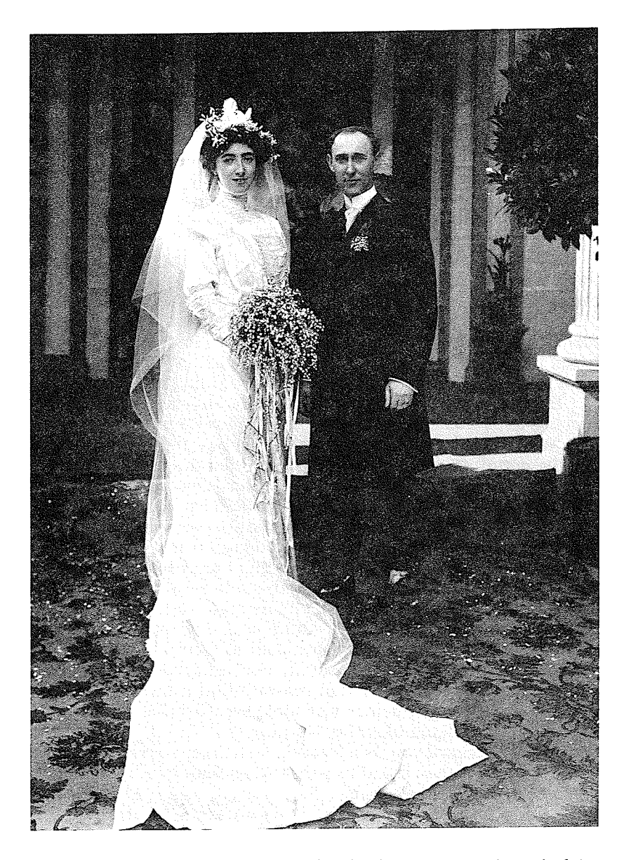
A society wedding in Newport, Rhode Island, in 1910. By the end of the 17th century, white had become identified with maidenly innocence. But pink, blue, and yellow bridal dresses persisted until the late 19th century, when "white weddings"—with bridesmaids, the best man, and composer Richard Wagner's "Bridal Chorus"—became an established tradition.