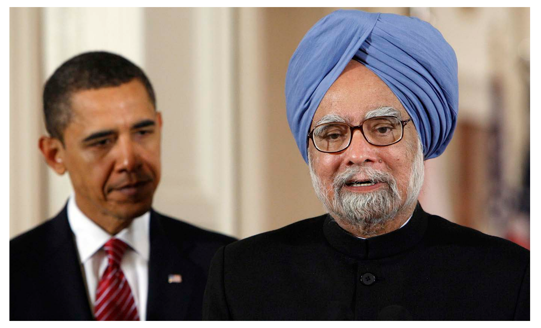
Prime Minister Manmohan Singh's visit to the White House in 2009 was one sign of the improved relations between the United States and India since the end of the Cold War.

It's also wrong to conclude that India is on a collision course with Beijing. Many Indian diplomats view China as relatively harmless. They believe that its activities in India's neighborhood are driven more by economic and energy interests than by hegemonic impulses, and can be parried with deft diplomacy. Prime Minister Singh and others call for more trade, people-to-people exchanges,