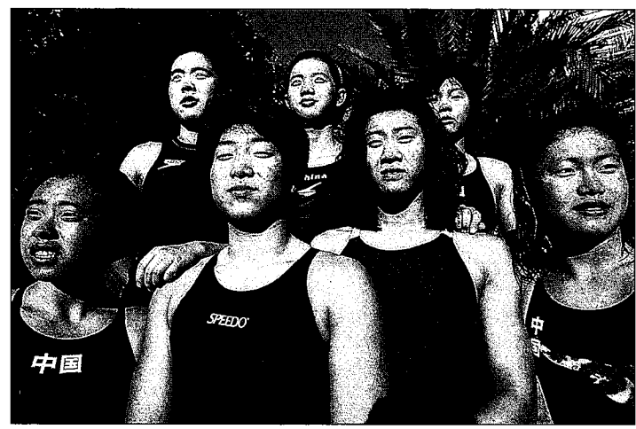
Scandal du jour: after a string of surprising performances, several members of the Chinese women's swim team tested positive for steroids in 1994.

By now the voice of a famous cultural diagnostician from the last century has become faintly audible. We return to the text for further clues and read that Prozac "seemed to provide access to a vital capac-