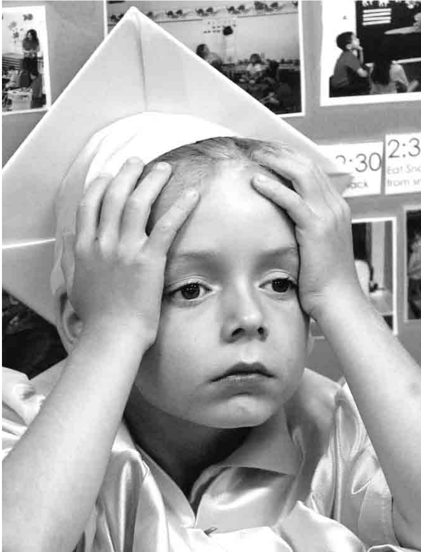
And it's only the beginning. A youngster awaits the graduation ceremony at a preschool in Danville, Kentucky. Three-quarters of the nation's four-year-olds are currently enrolled in some form of organized child care.

researchers that “every dollar California invests in a quality, universal preschool program will return $2.62 to society because of savings from reduced remedial education costs, lower high school dropout rates, and the economic benefits of a better-educated work force.”