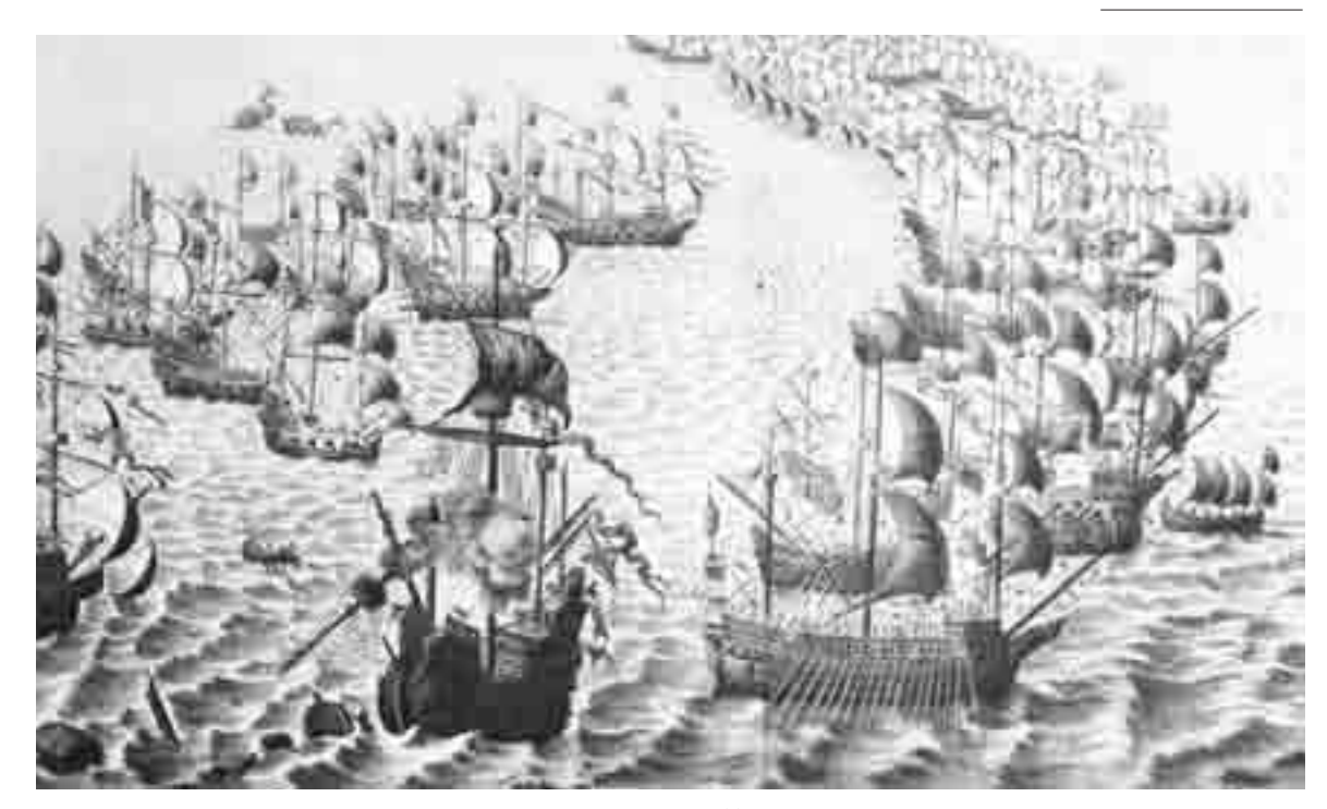
Spain quickly recovered from the material impact of the Armada's defeat in 1588, but the psychological impact on Spain's leaders was profound.

dards. The same phenomenon surfaced in the United States in the 1840s and '50s, when there was a general sense that the young American republic, if not actually in decline, had already seen its best days. The Founding Fathers, it was believed, had snatched away all the glory; there were no great crises or achievements left for Americans as they entered an age of malaise and "the forcinghouse of mediocrity," as James Russell Lowell put it.