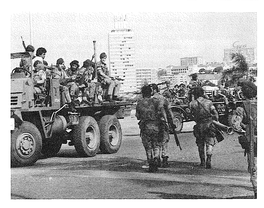
The last Portuguese troops left Luanda on November 11, 1975, when Lisbon officially gave up Angola. Most of some 500,000 white settlers followed.

guese. There is little U.S. programming, a bit more from Britain. A recent offering: "The Jewel in the Crown," a series about the end of British rule in India.