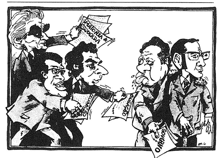
In this 1976 cartoon, Socialist Prime Minister Mário Soares and Portugal's bespectacled president, Gen. António Ramalho Eanes (right), rebuff would-be coalition partners, among them Communist Álvaro Cunhal (far left).

The Nixon administration was particularly aroused. Portugal's strategic importance was clear. It anchored the Atlantic end of NATO's southern flank, which already had its share of unstable governments (Turkey, Greece). And during the 1973 Mideast War, when other European nations refused to let U.S. transports flying supplies to Israel refuel at their airfields, the big C-141s and C-5As used the American base in the Azores, where Soviet submarine movements were also monitored.