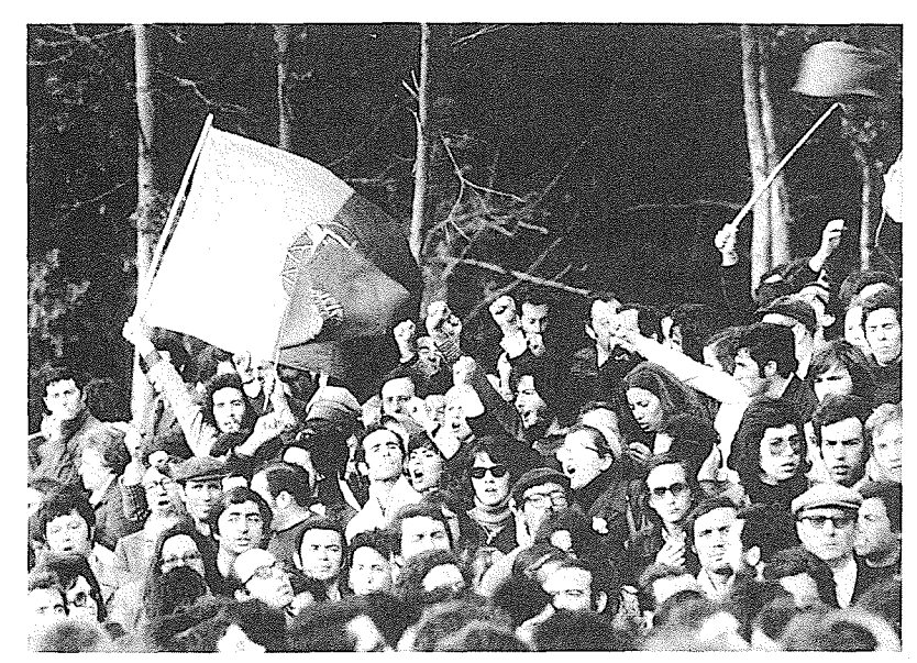
After initial hesitation, civilians cheered the April 25, 1974, Army coup that ended Portugal's New State. Soon, red carnations were worn everywhere, giving post-coup turbulence a name: The Revolution of the Flowers.

tary, Portugal's rate of "fixed" investment—the kind that creates jobs and exports—was the lowest in Western Europe. To compensate, Lisbon had in the mid-1960s begun to lure foreign manufacturers to its low-wage economy. While this strategy brought growth for a while, by the mid-1970s it had soured.