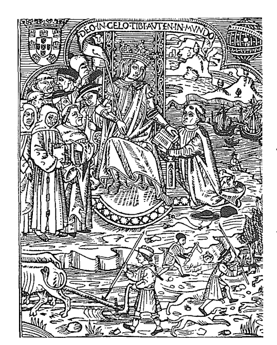
Farmers, fishermen, and merchant seamen had roles to play in Portugal's golden age, but in this 16th-century woodcut only clerics stood close to the Crown. Says the deferential inscription: "To God in Heaven but to you in the world."

On November 1, All Saints' Day, about one-third of the opulent city was destroyed. Voltaire described the quake in Candide (1758): "The sea was lashed into a froth, burst into the port, and smashed all the vessels lying at anchor there. Whirlwinds of fire and ash swirled through the streets and public squares; houses