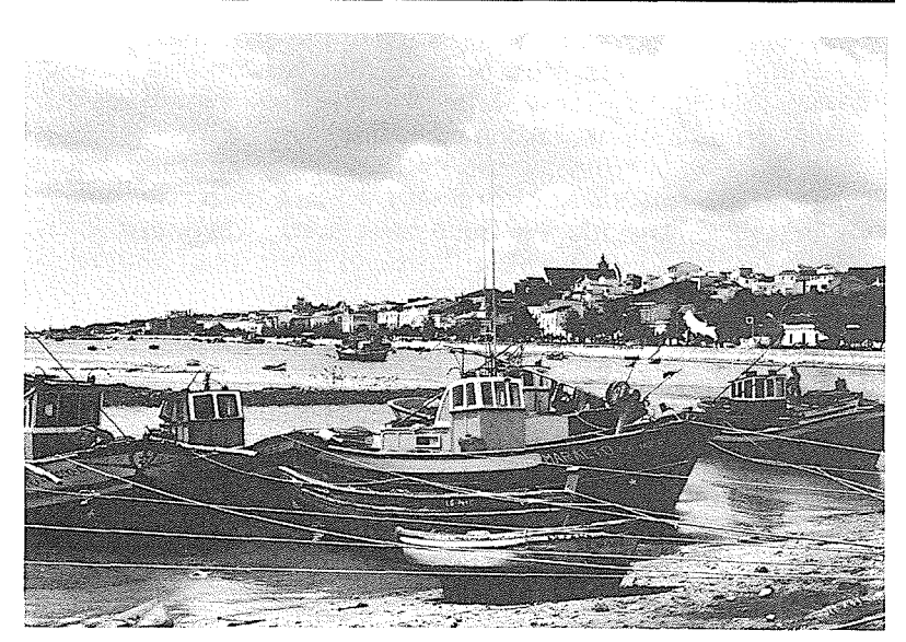
Lagos was the starting point for the early exploratory voyages of the 15th century. Today, the port is known for herring fishing and tourism.

sciences and at the same time to elevate the royal power to despotism." The competing goals—modernity and firm rule—would surface repeatedly in Portugal over the years as its income from the overseas colonies slowly declined.