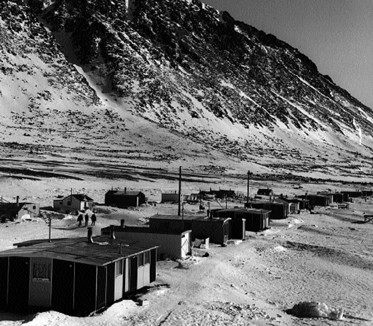
The tiny village of Grise Fiord remains the northernmost permanent settlement in North America.

on by an uncommonly barren but dramatic landscape. It is perhaps worth the telling, especially for those readers who, like myself, await their first epiphany from the world of nature. So, too, is the journey to the place where it occurred, which, as the expression has it, was well off the beaten path.