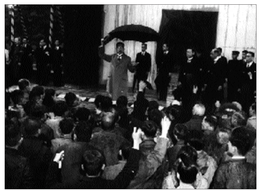
Standing in the rain outside the imperial palace in Tokyo on May 3, 1947, Emperor Hirohito doffs his hat to a throng of 20,000 gathered to celebrate the adoption of the new Japanese constitution.

the constitutional provision allow Japan to evade its international responsibilities? Is it time, as some contend, for Japan to become a "normal" country again?