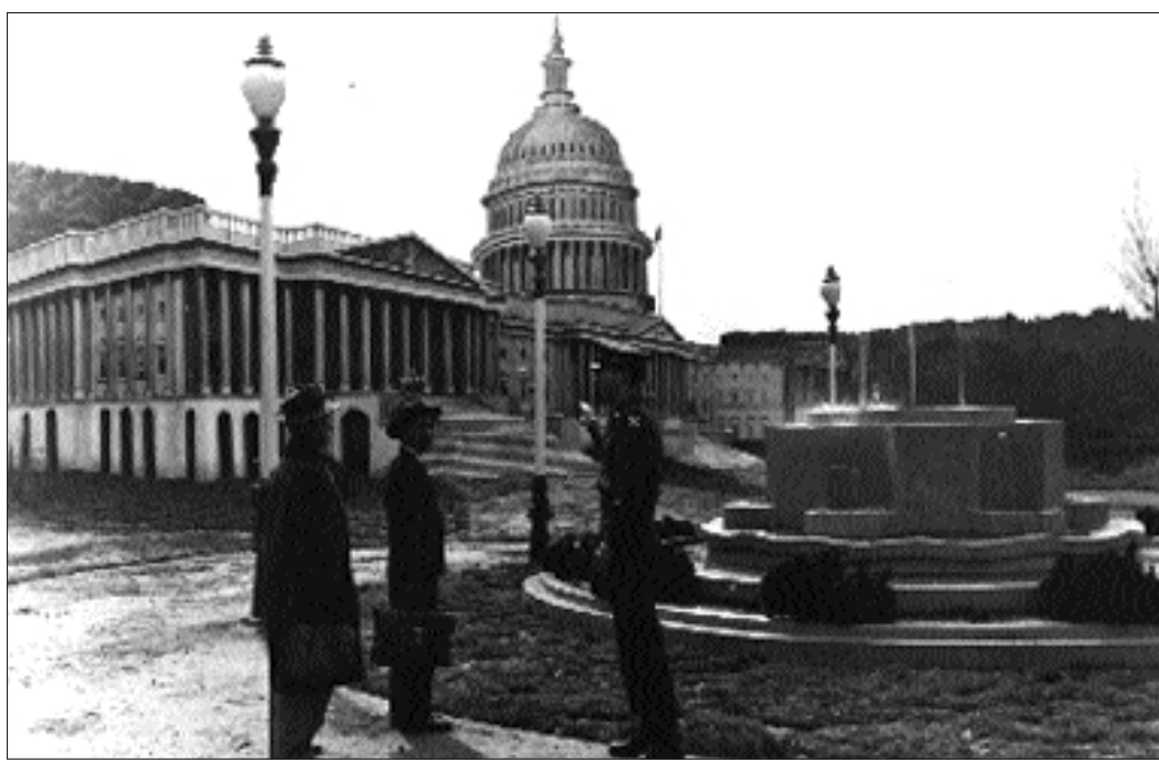
The effort to democratize Japan did not end with the new constitution. A Tokyo newspaper in 1950 organized a fair near Osaka that featured replicas of American landmarks, including a papier-mâché U.S. Capitol.

imposed by a foreign power. Milton Esman never imagined that the charter would outlast the occupation, which ended in 1952. Today, he credits its lasting popularity to the disparate groups—women, intellectuals, teachers, and labor unions—that fought against any basic changes that might encourage militarism or limit freedom of expression.