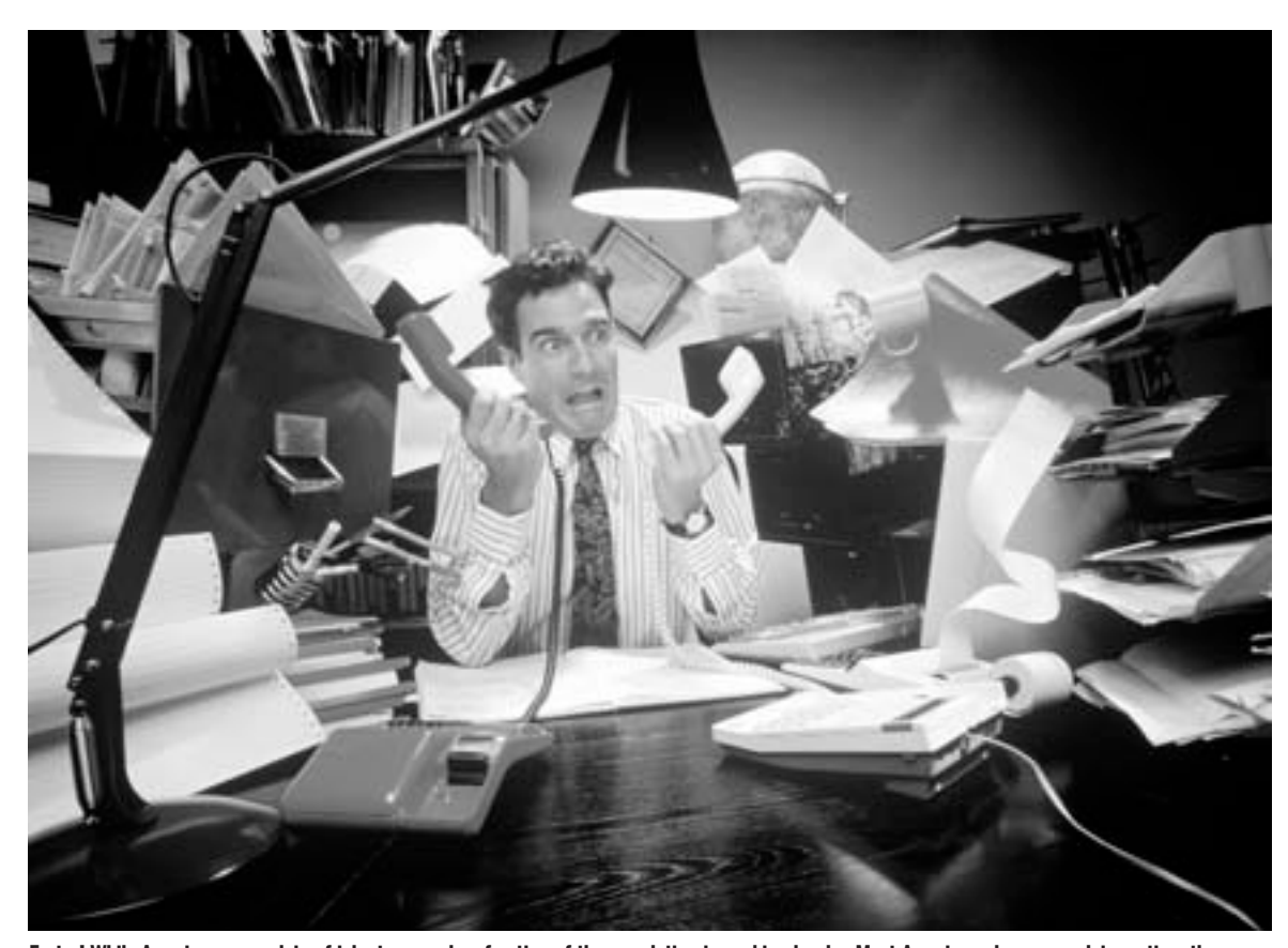
Faster! While Americans complain of job stress, only a fraction of the population is working harder. Most Americans have more leisure time than ever.

ties business—these developments and so many others have helped foster a vastly more competitive commercial environment than existed a generation ago, an era well within living memory for many American workers, who recall a time when U.S. industrial might was unchallenged.