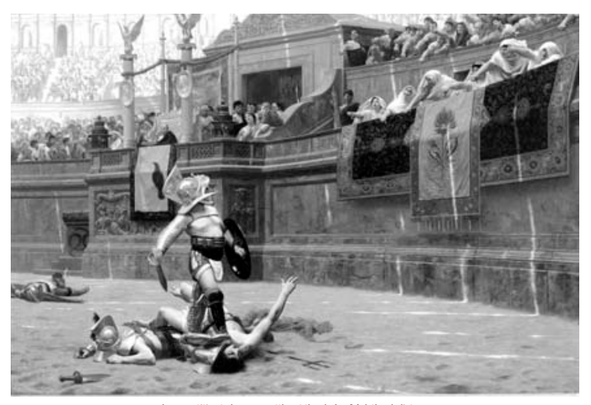
Is competition today more cutthroat than before? Ask the gladiators.

Nineteenth-century business practices were truly red in tooth and claw, while total output per person was so much lower in those days that merely staying alive was a competitive scramble for most people. Larger family sizes, meanwhile, meant more competition for parental attention, food, and inheritable resources.