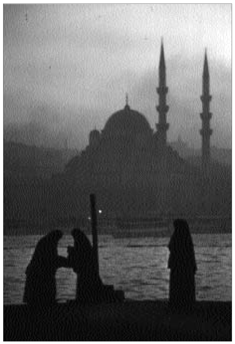
Three Turkish women in Muslim dress gaze across the Golden Horn at one of the many mosques that grace the shores of the Bosporus, the traditional divide of East and West.

(Kurdish Workers Party), the most militant and effective of the Kurdish guerilla groups, at his hideout in Kenya—a hideout, it emerged, that had enjoyed the protection of the Greek embassy. But Öcalan, who had proposed political negotiations even before his capture, called during his trial for a cease-fire. The earthquake gave his PKK a political opportunity to endorse this appeal, and amid the national mood of grief and redemption, it announced in September the end of the armed struggle.