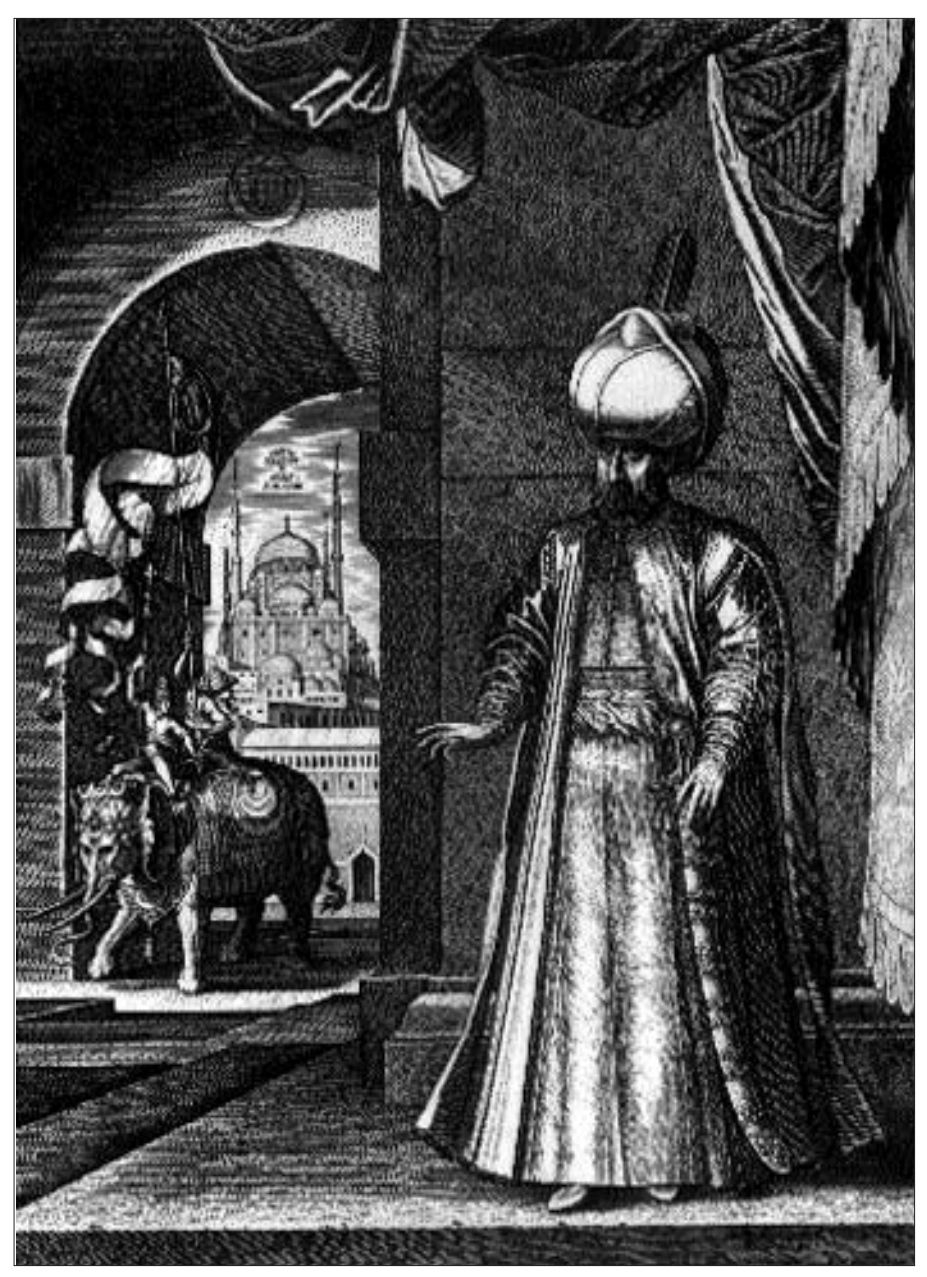
Sultan Süleyman the Magnificent (1520–1566), portrayed here in a 1559 engraving by Melchior Lorichs, presided over the expansionist golden age of the Ottoman Empire.

the Turkish mainland to occupy much of the Aegean coast. The successful campaign to drive them out was led by the founding father of the modern, post-Ottoman Turkish Republic, General Mustapha Kemal, known thereafter as Atatürk, "the father of Turks."