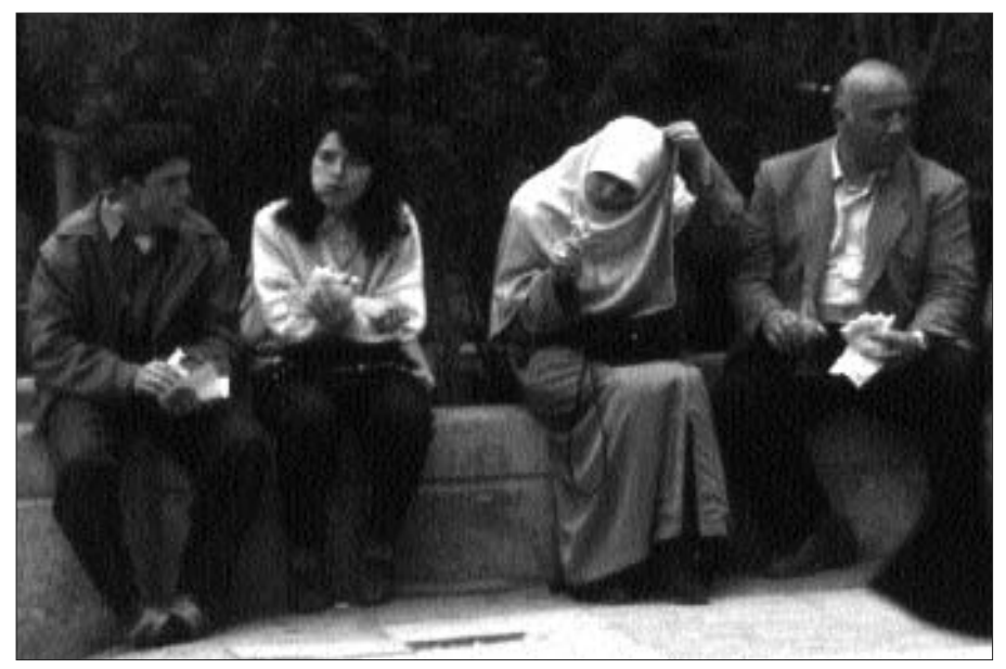
On the streets of Istanbul, 1994

However, as they have after each takeover, the generals voluntarily restored civilian rule, and in 1983 a newly elected government took office.