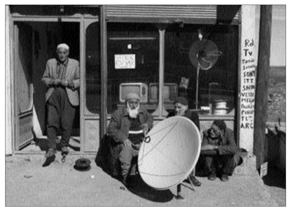
Kurdish-language television, beamed by satellite from Brussels, is one of the forces that have helped the scattered and beleaguered Kurds maintain a strong cultural identity.

the EU Council, the decision was not easily achieved. There were long wrangles, and direct pressure from Washington, before agreement was reached on the wording of the EU's position on Turkish accession. Even then, Turkey's response was uncertain, and Finnish and EU officials flew overnight to Turkey for a tense meeting. The eventual formula of the Helsinki Declaration welcomed "recent positive developments in Turkey" and concluded: "Turkey is a candidate state destined to join the Union on the basis of the same criteria as applied to the other candidate states."