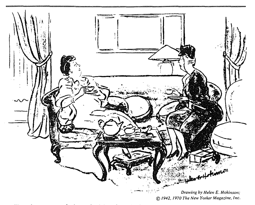
"It makes me so mad when I think how long I've been patient with India."

about $10 billion.) With American aid came hundreds of Yankee technicians and administrators who, as the years went by, eroded Indian good will by insisting on telling the "backward natives" how they should solve all their problems. Nonetheless, the aid was important to India and kept its economy afloat.