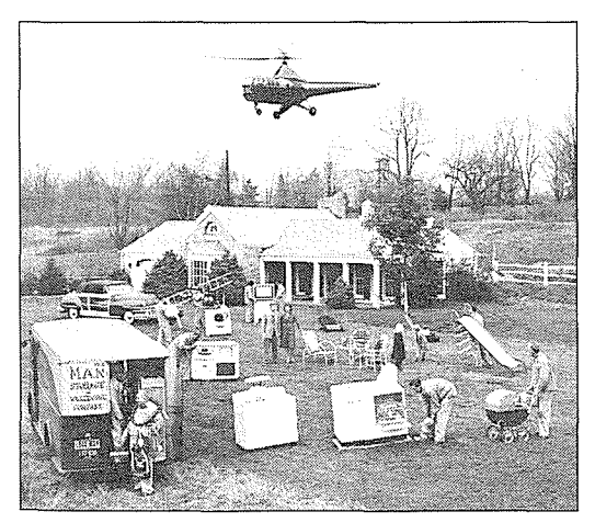
A helicopter fancifully included in Life's Dream Home of 1946 showed Hollywood's problem: suburbanites' distance from downtown theaters.

The new studio bosses also cut the number of films released. Increasingly, each motion picture had to be a potential blockbuster, able to stand on its own as a media event. Studio units making "B" movies, never-ending serials, animated cartoons. and newsreels—all regular movie palace fare during the 1930s and 1940s (and now seen in perpetual rerun on cable television's TNT and American Movie Channel)—saw their production slowed from weekly editions to special attractions and finally to nothing. All disappeared from the American movie industry by the mid-1960s. Hollywood, which had released a new feature every day of the year, was reduced to producing and releasing but a handful of new feature films each month.