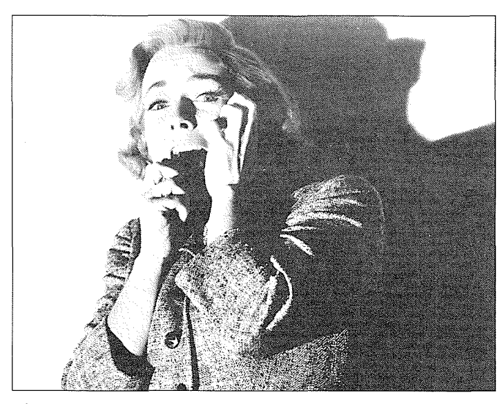
Alfred Hitchcock's Psycho (1960). A darling of the critics who was also a box-office success, a film master who also worked in TV, Hitchcock showed Hollywood how to survive after its Golden Age.