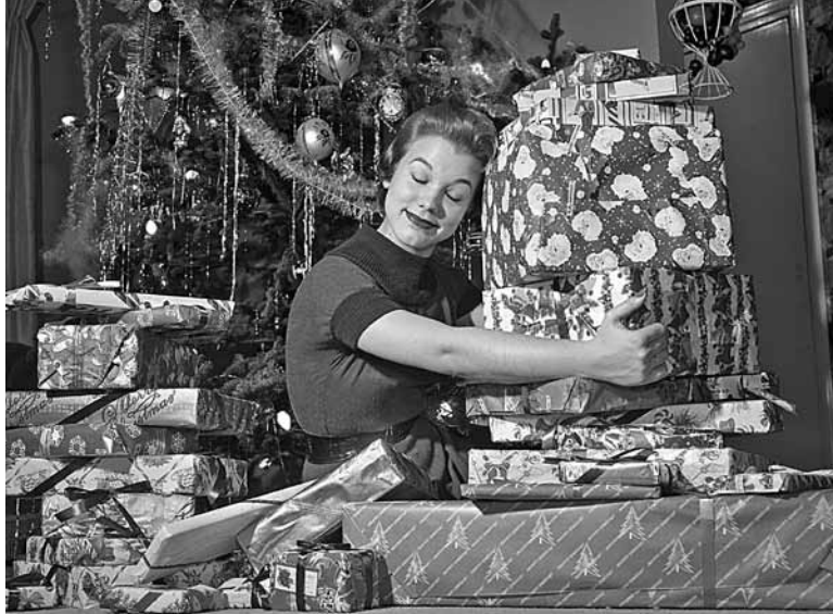
In the postwar affluent society, presents were piled high under American Christmas trees.

The second caveat is that economic progress may be overrated. Younger Americans may be less obsessed with material goods as the be all and end all of a satisfying life. Moreover, many Americans will enjoy rising incomes over their lifetimes, reflecting experience and seniority. In 2009, for example, the median income of working men aged 45 to 54 was 40 percent higher than