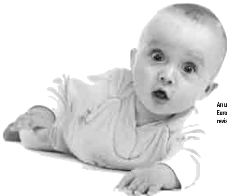
An unexpected baby boomlet in Europe has forced demographers to revise some projections.

In a society in which an average woman bears 2.1 children in her lifetime—what’s called “replacement-level” fertility—the population remains stable. When demographers make tiny adjustments to estimates of future fertility rates, population projections can fluctuate wildly. Plausible scenarios for the next 40 years show world population shrinking to eight billion or growing to 10.5 billion. A recent UN projection rather daringly assumes a decline of the global fertility rate to 2.02 by 2050, and eventually to 1.85, with total world population starting to decrease by the end of this century.